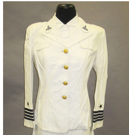
clothing worn by a group of people