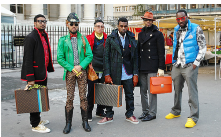
group of people (often accompanying someone)