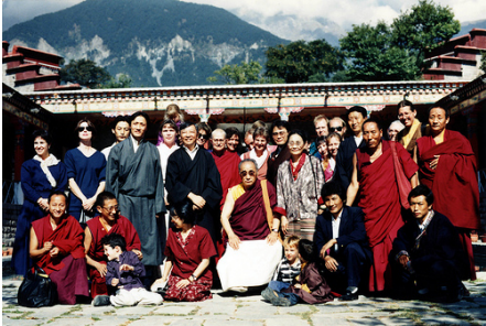
group of attendants with a person (often an influential person within religion)