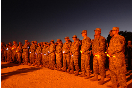
line of people waiting to receive something