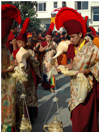
long piece of cloth (often worn by monks)