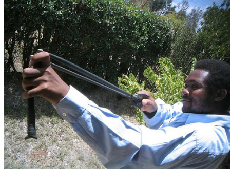
draw out to a greater length or width